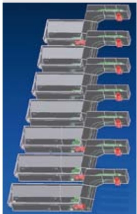
VARIATIONS HOPPER / ELEVATOR